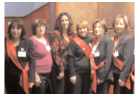
Organisers of the PCRF Symposium

He has developed new techniques that can accurately identify metastatic (spreading) and non-metastatic cancer cells in breast cancer. If this is proved accurate than this will have a major influence in the way that cancer is treated. Secondly he has pioneered a more targeted 'magic bullet' for treating