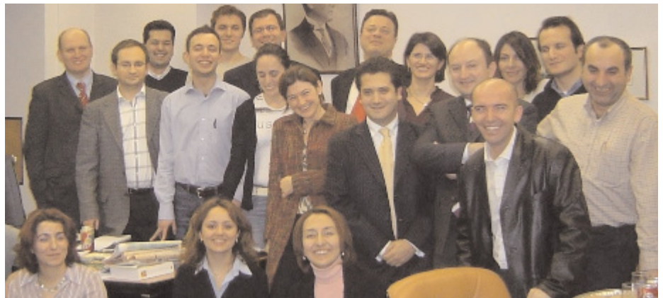
The management committee of METU