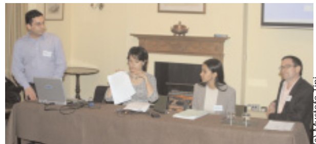
Some of the speakers from the panel

When all the new graduates and students left most of the professionals were still at the meeting place where they also had the chance to talk with each other and discuss about other subjects related to current issues in the Turkish Community.